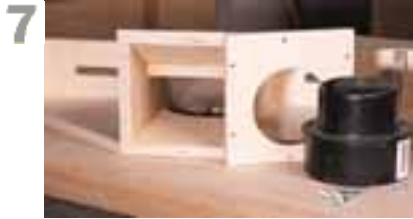
7 Inside view of the dust chute from the rear including the plastic 4" to 3" dust collection hose adapter. Rout the 3" hole for the adapter with the circle-cutting jig or use a "fly cutter" in your drill press.

Make the round tabletop inserts from 1/8" acrylic. I made three inserts to cover most of the router bit sizes I'd encounter. First set the circle jig to cut a circle that is the same size as the insert hole. Set your router to make an outside cut instead of an inside cut. To rout the acrylic, just drill a hole to accommodate the circle-cutting jig's pin or