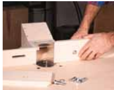
Attach the fence faces using 3/8" roundhead machine screws, a star washer, flat washer and wing nut. I tried using hex-head bolts but switched to screws because a screwdriver can be used and makes a more secure attachment with less trouble.