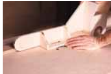
Break in your router table by milling the slots in the fence subfront that will allow the fence faces to adjust into or away from the router bit. Lay out the stop/start lines and plunge cut the slots.