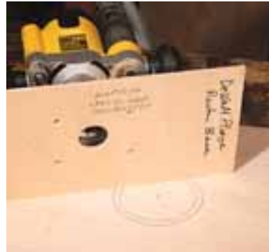
Another illustration of the first photo.

4 dimensions for cutting inside or outside circles.